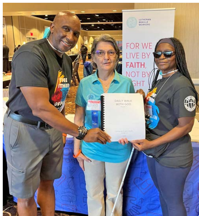
Volunteers present a braille volume to a Texas resident.

One major factor in LBW's ability to reach thousands of people every single year is the volunteer work force dedicated to sharing the Gospel. LBW has over 3,200 volunteers engaged across the country. Through Lutheran Braille Workers' partnership with the LWML and the countless volunteers in Texas and throughout the country, many who are blind or visually impaired will be able to experience the love of Christ for themselves.