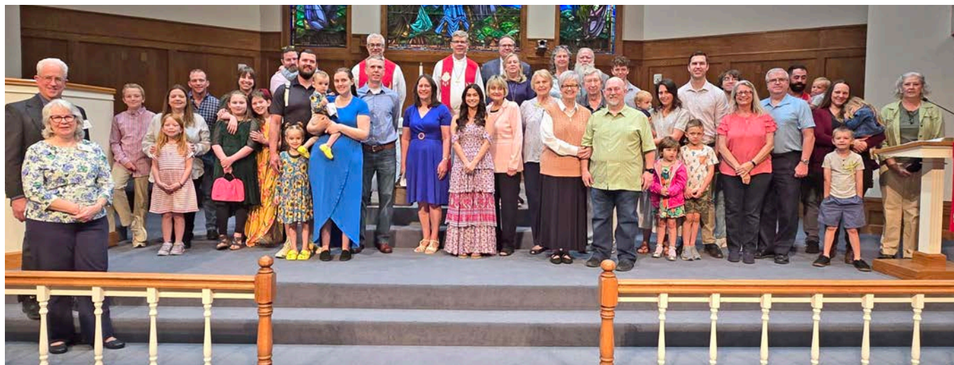
Fifty-four people joined the family of Our Savior on April 13.