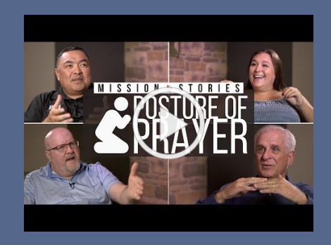
Posture of Prayer