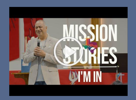
Expansion Mission Network