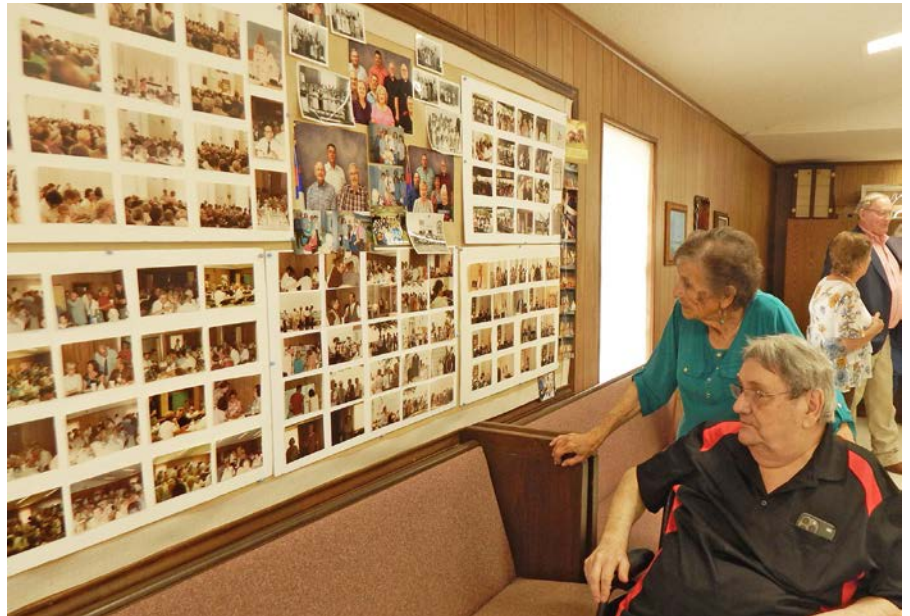
Trinity, Riesel, members enjoyed looking at photos from the past.

"It was a joy to celebrate 140 years of ministry with the dear people